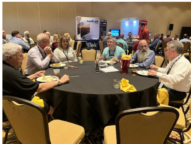
Lunch and Excellence Awards Presentation

( https://www.facebook.com/SEAOofArizona ).