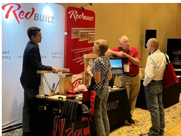
Exhibitor Booths at 56th Conference

The SEAOA's Annual Convention and Conference is the primary funding source that SEAOA uses to fund our outreach efforts to Arizona's universities, high schools, and middle schools. It also supports our efforts to make sure