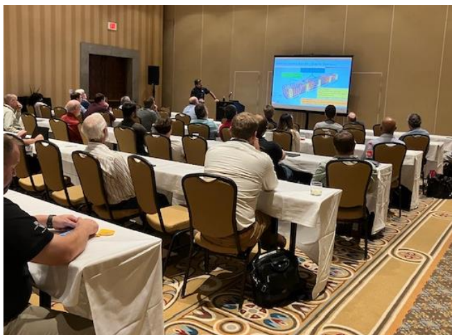
56th Convention and Conference Presentations