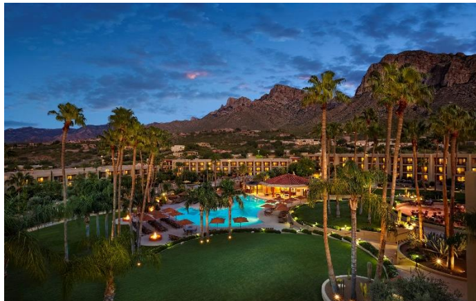
Hilton El Conquistador, Tucson, AZ

During May 12-14, the SEAOA was proud to welcome back roughly 130 Structural Engineering professionals to Tucson, Arizona, where we held the 56th Anniversary SEAOA Convention and Conference. The SEAOA Board was grateful to be able to return to our first in-person conference since 2019. This successful event brought together those in the industry from Arizona and across the southwest to the beautiful Hilton El Conquistador.