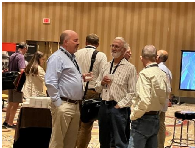
Networking at 56 th Annual Convention and Conference